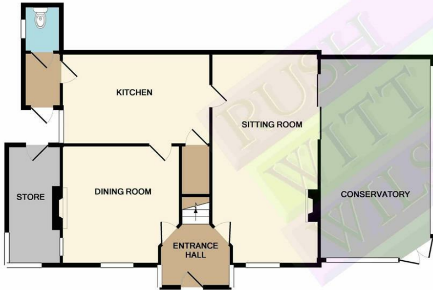
GROUND FLOOR APPROX. FLOOR AREA 1093 SQ.FT. (101.5 SQ.M.)